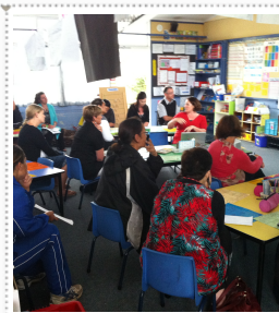
St Mary's Inspires others